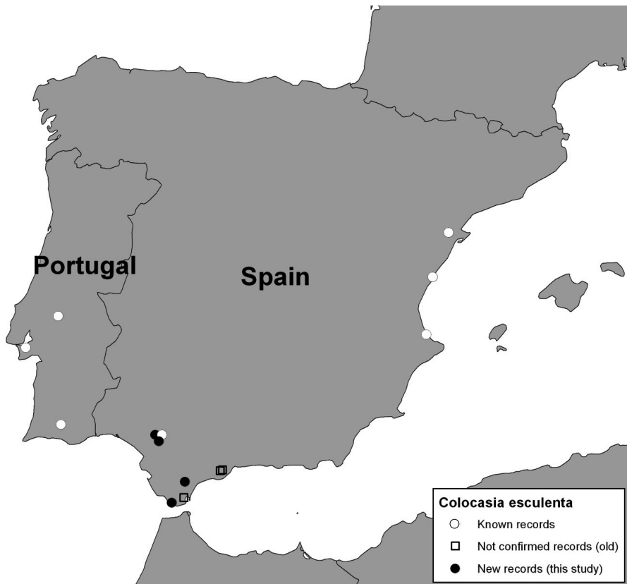
Figure 1. Published records of Colocasia esculenta (L.) Schott in the Iberian Peninsula. Empty squares show records indicated in the ancient literature, which could not be confirmed in this study, likely due to the heavy environmental modifications caused by humans in those areas. Records from Portugal must be considered at present as ephemerophytes escaped from cultivated lands. The remaining dots correspond to naturalised populations. Registros publicados de Colocasia esculenta (L.) Schott en la península ibérica. Los cuadrados vacíos muestran registros indicados por literatura antigua, que no pudieron ser confirmados en este estudio, probablemente por las profundas modificaciones ambientales provocadas por el ser humano en esas áreas. Los registros de Portugal deben ser considerados, por ahora, como efemerófitos escapados de cultivos adyacentes. El resto de registros corresponde a las poblaciones naturalizadas.

impacts as well as two specific questions related to the potential impacts on economy and human health. The questions were grouped into three categories (critical, key and secondary). Thus, if any of the critical questions has been answered with the option “a”, the output is “high risk”. If more than three key questions have been answered with the option “a”, the output is “high risk”. Each question receives generally from 0 to 5 points. If all questions are answered, the final sum varies between -14 and 63. To facilitate easier interpretation, this output value is then transformed onto a 0-100 scale, so that the final output is “low risk” (total sum < 54 points) or high risk (total sum \geq 54 points). Therefore,